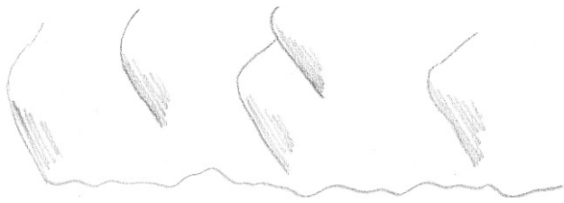
Subduction zone/ trench